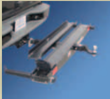
Adjustable Wheel Stops allows smaller bikes to be centered on the carrier

Able to tow up to 3000 lbs. behind the single motorcycle carrier. Strict weight limits apply, consult ( www.VersaHaul.com ) website for more specifics.