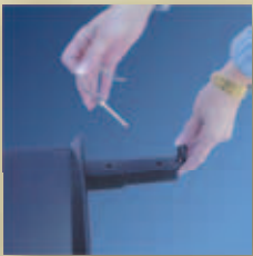
Retractable Tiedowns for increased safety