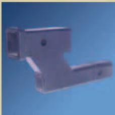
Hitch Riser Class III raises the hitch 4 inches (400 lbs. limit) -Optional

Able to tow up to 3000 lbs. behind the single motorcycle carrier. Strict weight limits apply, consult ( www.VersaHaul.com ) website for more specifics.