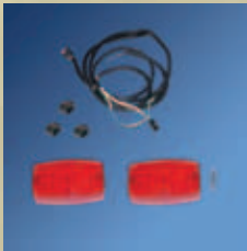
VersaHaul Taillight Kit stop, turn and tail, flat 4 connector -Optional